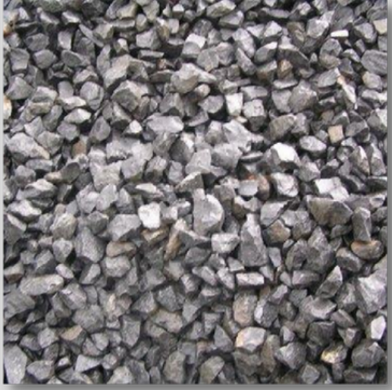
40mm Blue Metal