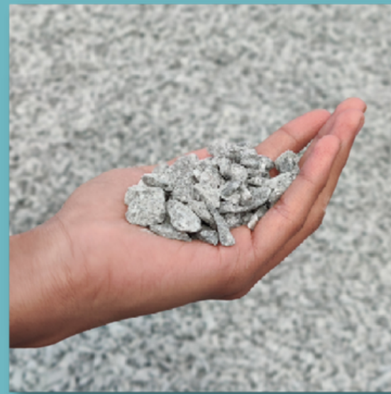
20mm Blue Metal