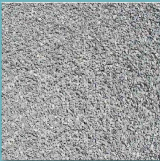
6 MM Blue Metal