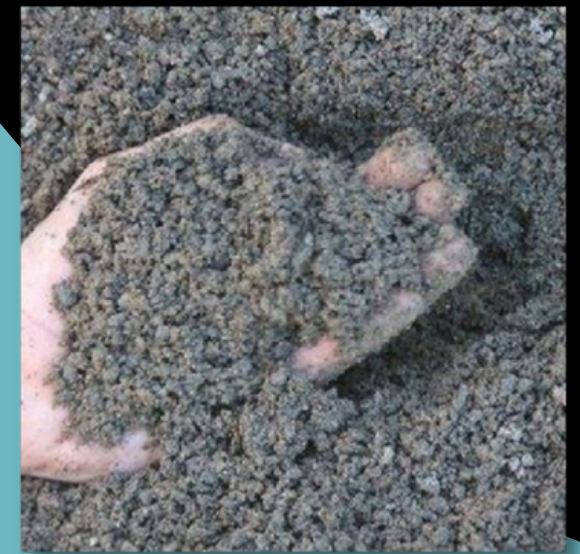
12mm Blue Metal